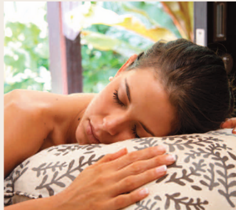
THE FACE Facials by Natura Bissé

NATURA BISSÉ defines advanced effective skincare with their inspiring and luxurious products and oil blends. Coupling nature at its best with technology to support and enhance, each of these facials offers a unique and personal skin perfecting result.