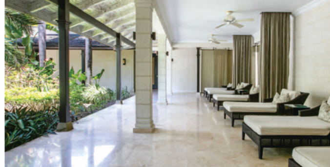
THE BODY Wellness massages

Muscle Melt 50 minutes $390 80 minutes $515