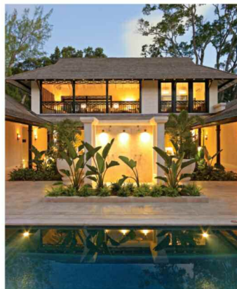
The Spa at Twilight

W e have been inspired to launch Wellness Retreats. Between the 7th and 14th of March we shall offer this package that includes yoga (which we do a few times a week throughout the year anyway), Pilates, ELDOA, hikes, beach body workouts and a nutritional seminar. Also included are 4 spa treatments (from a selection of massages, scrubs, Indian head massage and mani or pedi). We had our first retreat in October that was well received. It's rare in the Caribbean to have this kind of spa and wellness experience in a luxury hotel and we are extraordinarily proud of The Spa which is pivotal to this week of activities. We will also hold Wellness Retreats from 22nd May to 31st May and 16th to 25th October (which coincides with some UK half terms).