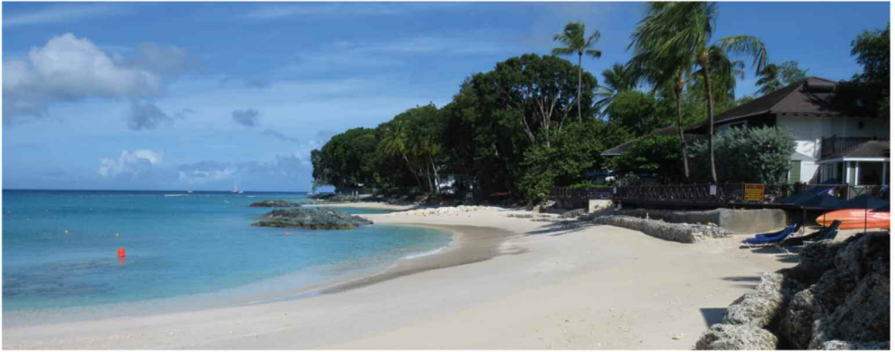
The Sandpiper's Beach taken in November

A s many of you know, Settlers is an exciting villa development that we are undertaking, with a start date of April 2015. With Settlers being a direct neighbor of Sandpiper to the north, we are taking the opportunity to close Sandpiper and are planning some rather lovely upgrades. We are so sorry that we shall not be able to welcome those that regularly visit between April and the beginning of November, our closure period. We would very much like to still look after you however, so please read on for the offers at Coral Reef Club as we are now staying open for our traditional mid May to mid July closure and have a great offer for that period. If you are a regular Sandpiper guest outside of that period, we shall be in contact with you. When we re-open Sandpiper, we will have made significant progress to the Settlers project and will move the work to the north side of Settlers, far enough away so that our guests will not be disturbed.